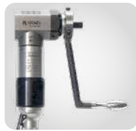
Crank arm single feed stroke