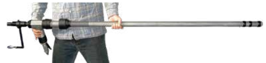
On demand we offer 3WTTC with reach up to 5 m.