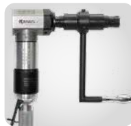
Crank arm with double feed stroke