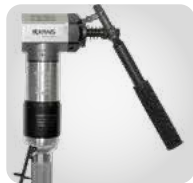
Lever feed handle