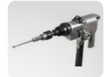
ROLLING MOTORS → CHAPTER PAGE 44