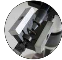
Heavy duty locking system

135 MM (5,3") The large cutter head, very sturdy and rigid, designed to fasten the wide range of cutting inserts.