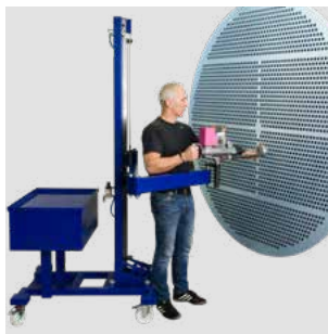
Auto K60 fastened on the Flexpander.