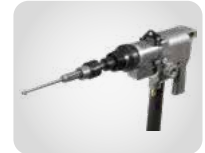
ROLLING MOTORS → CHAPTER PAGE 44